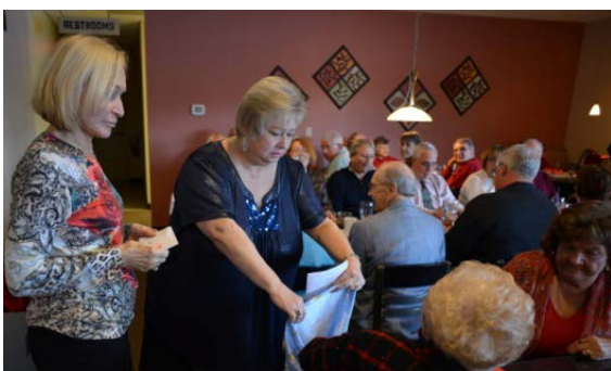
Drawina for Door Prizes