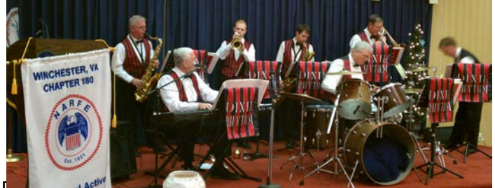
Holiday Entertainment by The Dixie Rhythm Band (Winchester)