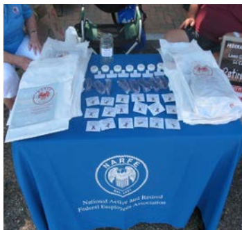
NARFE Table Cloth

Chapter PR Chairs: We continue to make progress in filling Chapter PR positions. There are now 46 Chapters with a PR Chair, a gain of 6! The PR Chair should help their Chapter President plan and coordinate events to get the NARFE name before the public. We want the public to know who we are and what we stand for as an organization. There is also more good news.